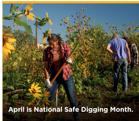
April is National Safe Digging Month.

Before you dig, call 811 or visit call811.com to mark underground utility lines. 811 is a free service that helps keep you and your community safe.