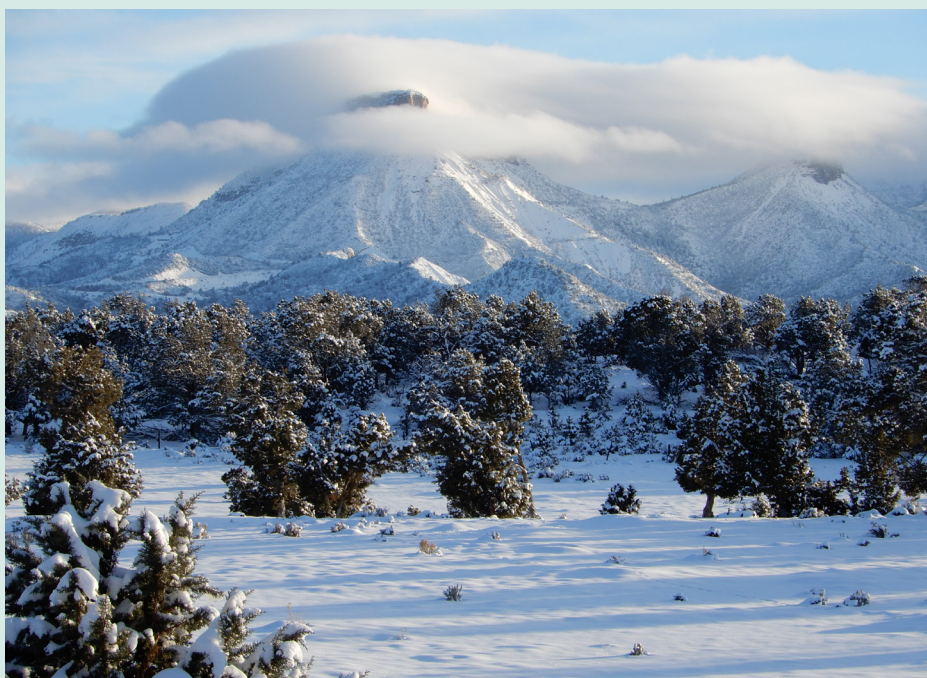
Clouds Surrounding Point Lookout by Bill Di Paolo