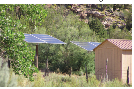
2.8 kW net metered Battle Rock Charter School solar array built in partnership with EEA in 2006. The array is still in production, helping to reduce the school's monthly power bill.

connected to the EEA Distribution system was the 2.8-kilowatt array installed by a partnership between Battle Rock Charter School and EEA in 2006. The array is still in service today, helping to provide power to the school located in McElmo Canyon.