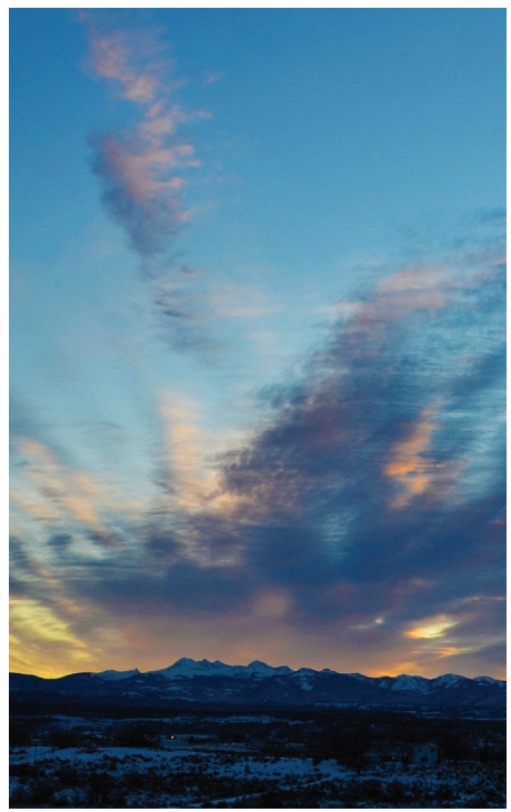
Co-op Photo Contest Winner October 2022 "Sunrise Over the La Platas & Mesa Verde" by Chalana Wilson

It is difficult to wait in an emergency situation, but approaching an energized area puts you and fellow first responders at risk of electrocution. Always wait for the utility to confirm the lines are de-energized.