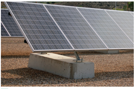
10 kW EEA Solar Assist community solar garden located west of EEA Headquarters.